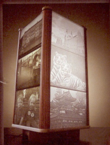
Photo engravings on Acrylic

Don't limit yourself to drawing, now you can make what you design.